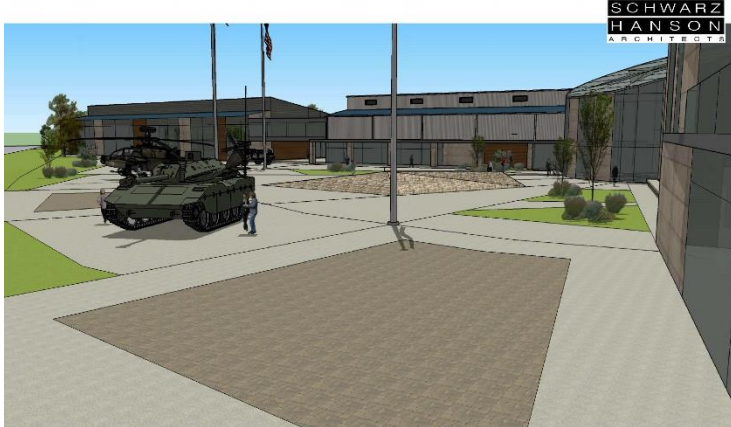
Memorial Bricks - Flag Plaza - Looking South